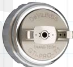
No T1 Trans-Tech Air Cap