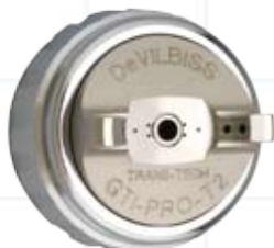
No T2 Trans-Tech Air Cap