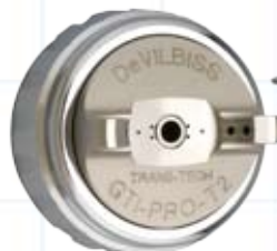
No T110 Trans-Tech Air Cap