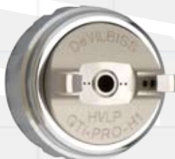
No H1 HVLP Air Cap

Model Air Cap Base Digital Models Fluid Tip